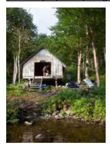
Shelters $ 20 + tax per person per night

Two types of shelters that are available: