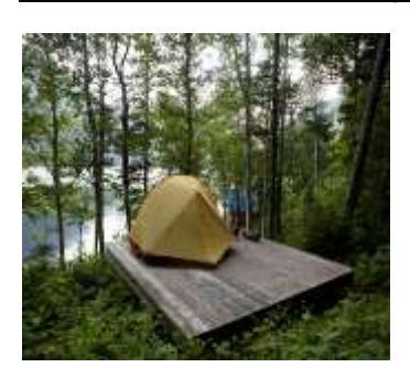
Camping platforms $ 15+ tax per plateform per night

The campground has two wood platforms measuring 3.7 m by 3.7 m, each of which can accommodate two two-person tent. A metal wire circles around the platform to provide an anchor for the tent.